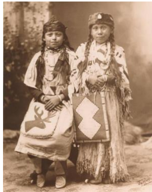
Two Yakama Nation girls circa 1892-1899

The Yakama tribe were a semi-nomadic group, meaning they moved from place to place, living on lands that went from Washington's Cascade Mountains to the Columbia River. The Yakama tribe lived in the same way since time immemorial , meaning before people can remember or was even recorded.