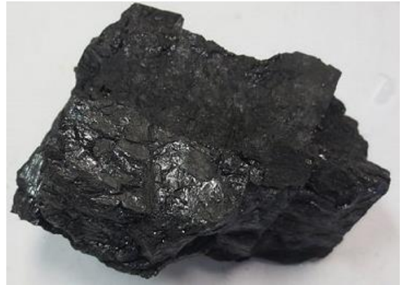
Lump of coal, an energy rich fossil fuel that has been used to fuel steam locomotives, to heat homes, and to fuel electric power plants around the world

The discovery of coal forever changed the lives of the Yakama people around Roslyn because it brought in white settlers . But what is coal? Coal is a rock that burns. Coal is mostly made from the chemical carbon. Coal started out as plants that over time were compacted, or squished. Over time this compacting caused it to harden. Due to this pressure and the addition of heat, the carbon would chemically change into coal.