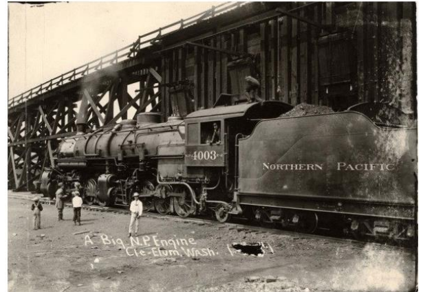
Northern Pacific locomotive loading coal in Cle Elum, 1910.

Roslyn's geology and geography created coal fields. Once that coal was found by the railroad, it was mined and used to fuel locomotives. The Northern Pacific Railroad and its coal mines built the community of Roslyn. The work in coal brought in workers from around the U.S. and from Europe. A direct link connects the discovery of Roslyn's coal to the building and development of Roslyn.