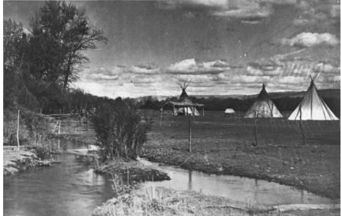
Indian camp in Kittitas County, Washington circa 1900 - 1919

In summer they lived in camps that were moveable. These structures were more like tepees, made of cattails, or tules , that were woven together and animal skins, like buffalo hides.